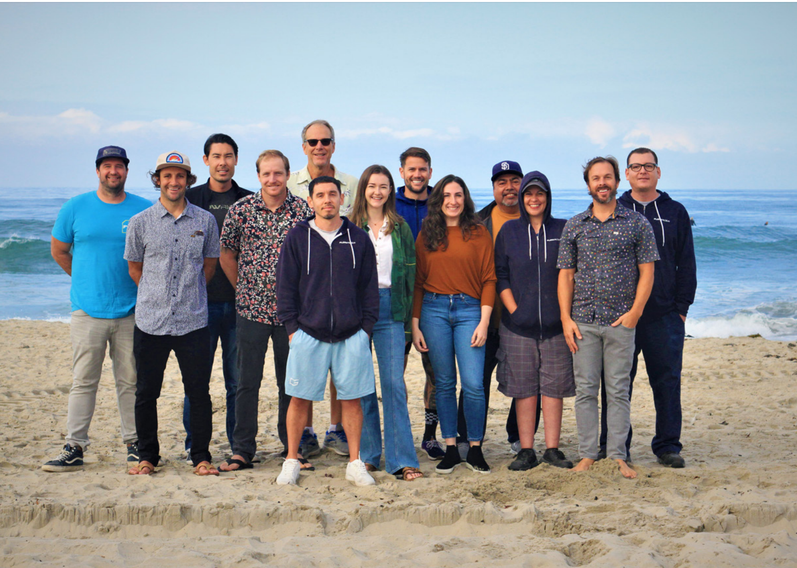
The FlowRider team who brought you FlowSurf